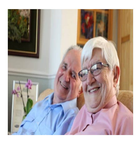
How Pat crossed the line